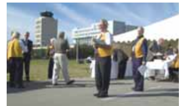
Goldwing Ambassadors ready to assist WAA's guests.