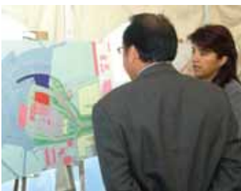
Participants examining site drawings and designs.