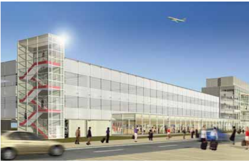
The Parkade will be built and completed during 2006.

Recent tenders have been awarded to Man-Shield Construction [Groundside infrastructure projects], Wardrop Engineering [Airport Redevelopment engineering services] and PCL Construction [Parkade component].