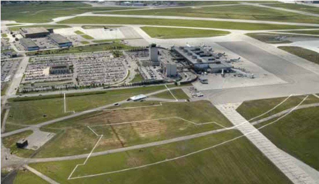
Actual building perimeters were outlined on the site to provide an accurate sense of the scope and location of future facilities. The tent erected for the Groundbreaking event can be seen within the future Parkade area, directly across from the Arrivals portion of the new Terminal Building.

Official Groundbreaking Ceremony September 15, 2005