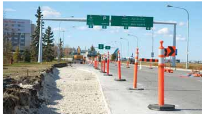
Work is started on the widening of Wellington Avenue, in order to facilitate traffic flowing during all upcoming construction phases.