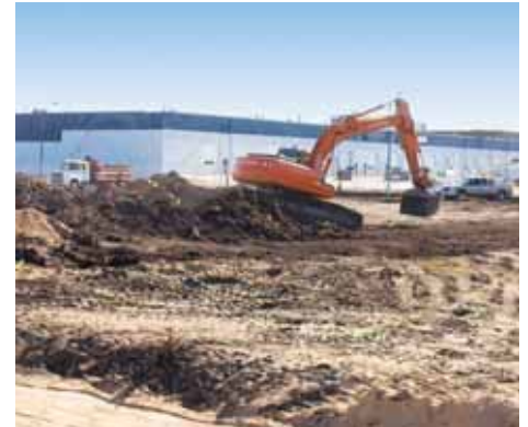
Construction of the South Parking Lot will provide new space for vehicles while the new Airport Redevelopment parking facilities are being developed during 2006.