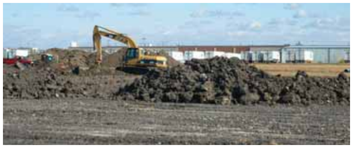
Located north of Wellington Avenue, a major Staging Area will be required to support all other construction activity over the period 2006-09.