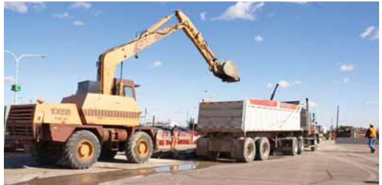
Improvements to Parking services will be a major focus during the coming year, including relocation of waste and storm water lines.