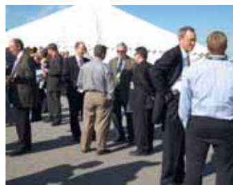
Over 300 people attended the Official Grand Opening Ceremony, representing WAA customers, stakeholders and the community.