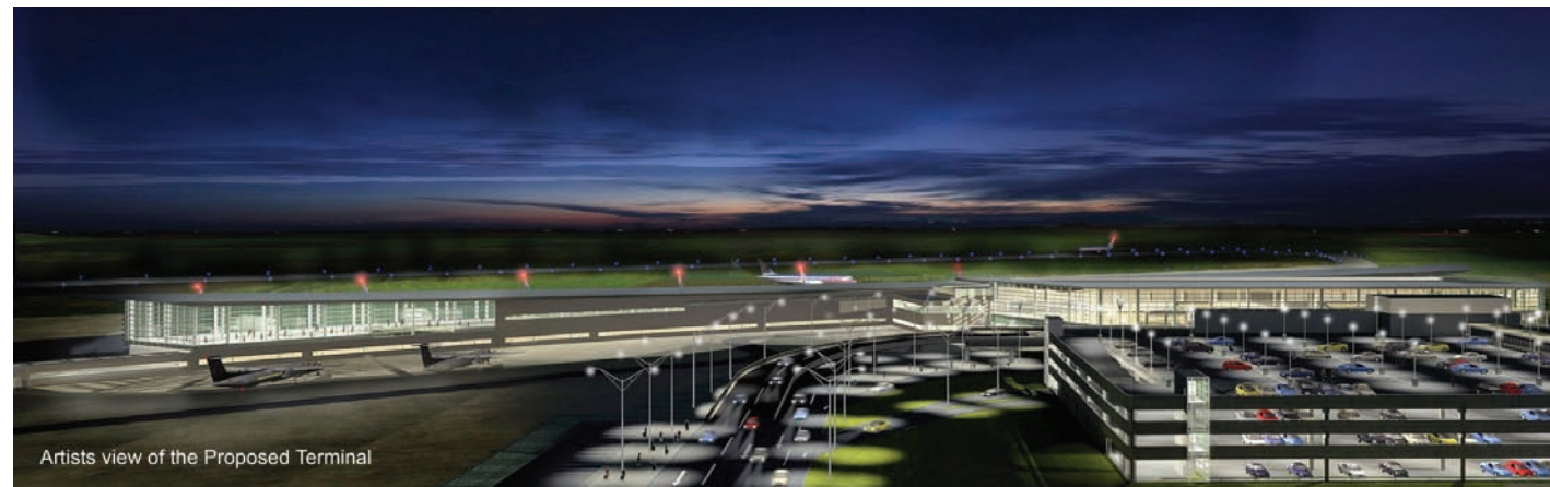
Artists view of the Proposed Terminal