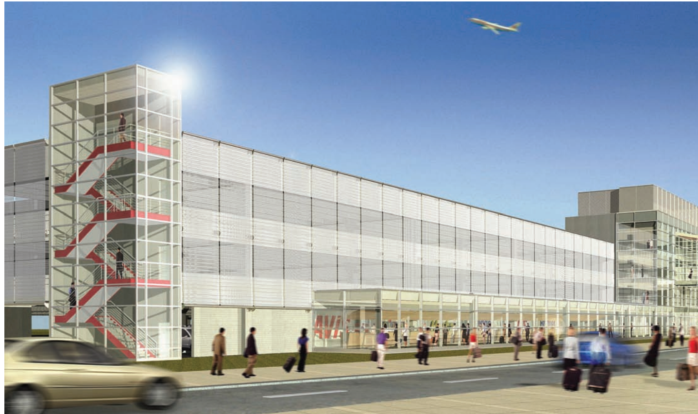
WAA customers will enjoy more comfort and convenience with improved parking infrastructure.

Construction of WAA's modern new parkade facility began in the fall of 2005 and is due for completion during the fall of 2006. The project is on target in terms of timing, with some elements ahead of schedule [e.g. concrete footings] due to a warmer than usual winter season in early 2006.